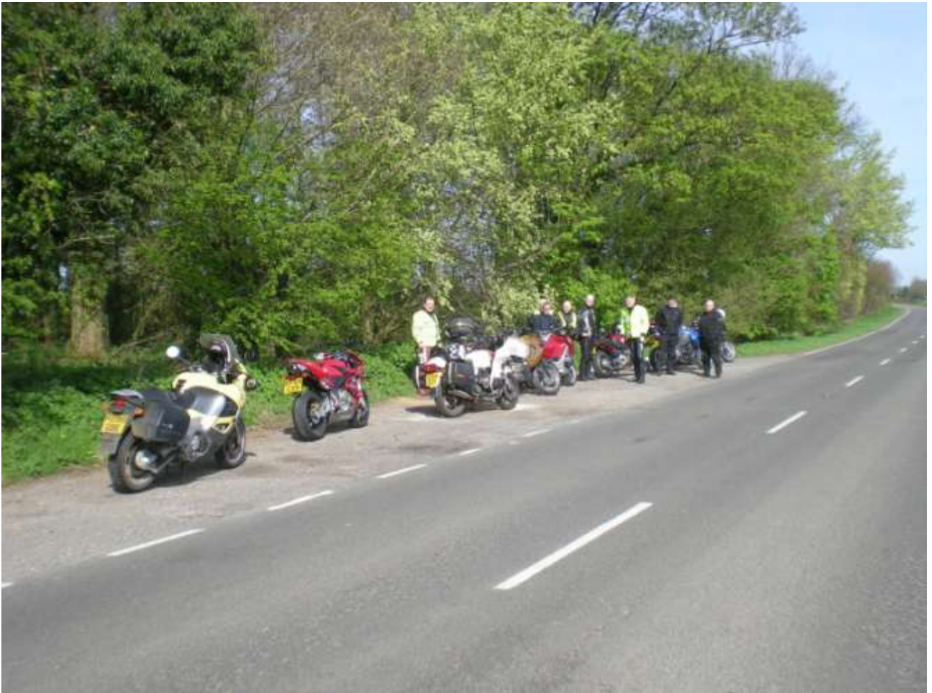
Group observed run on 10 Apr stopped near Horncastle

THE NEWSLETTER OF THE LINCOLNSHIRE ADVANCED MOTORCYCLISTS IAM GROUP 7176, REGISTERED CHARITY 1049955, SUPPORTERS OF THE BMF