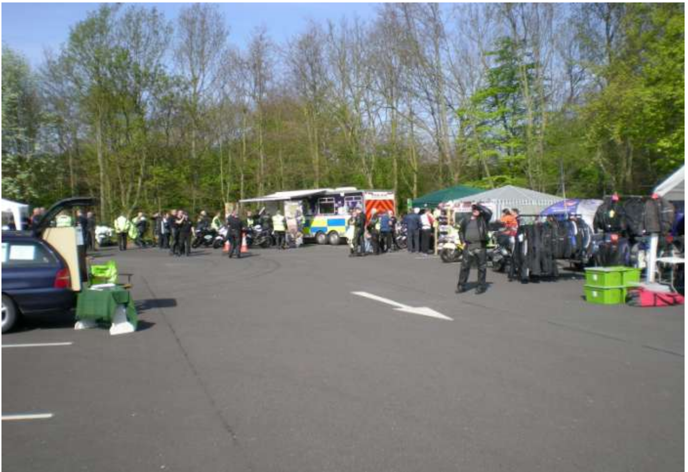
The launch of the 2011 Humberside BikeSafe at the Humber Bridge on 17 Apr. You can see Iain's car and the group stand on the left of the picture. Thanks Iain.