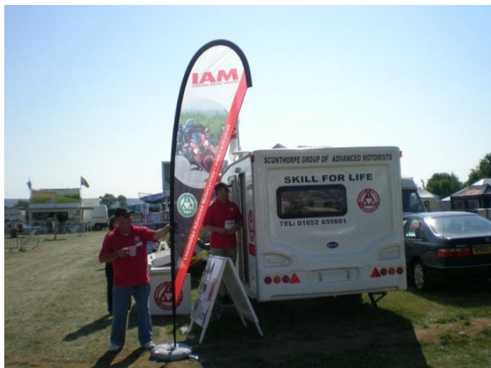
Scunthorpe Group at Winterton Show, with LAM banner